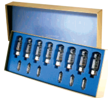
The supplied tubes are the same ones used to test the MC2000 prior to packing. They are placed in a specially designed case for transport.