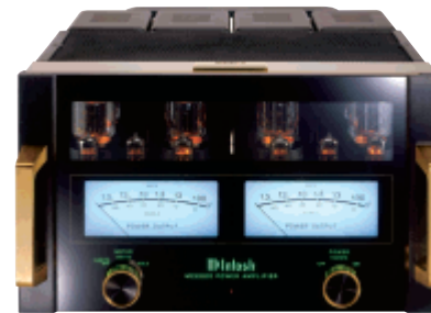
The styling of the MC2000 complements the look of current McIntosh components. The front window showcases the warm glow of the tubes.