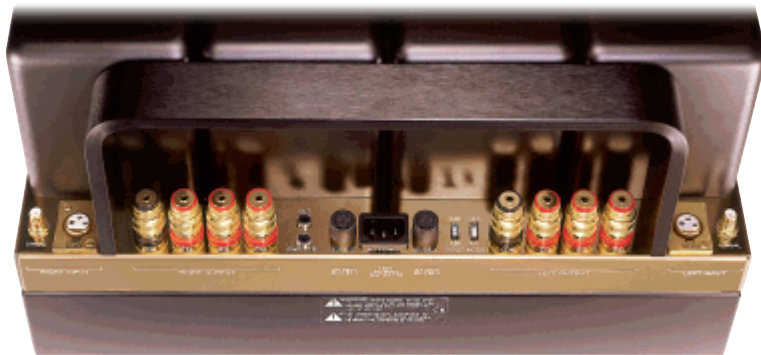
Rear view of connector panel. Metal arch serves as a handle.

Balanced and unbalanced inputs 24-ct. gold-plated input jacks 24-ct. gold-plated 200-ampere multi-way output binding posts 24-ct. gold-plated handles and knob trim rings 24-ct. gold-plated identification plaque Illuminated peak-responding wattmeters with hold Remote power control connection to McIntosh Control Centers and Preamplifiers Removable cage cover for tubes Stainless-steel chassis with titanium gold mirror finish Glass front panel with illuminated nomenclature Certificate of authenticity showing production number and total build quantity (sent by mail)