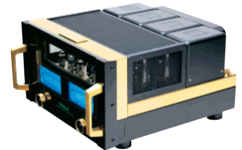
The MC2000 includes a removable cage that protects the tubes as well as curious fingers. The amp is shipped with the cover off.